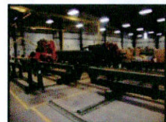
Squaring and Nailing